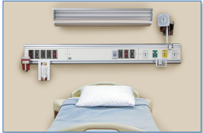
Figure 1. Majestic Series Recessed Single Tier Headwall System

The Amico Majestic Series Recessed Single Tier Headwall shall be manufactured by Amico Corporation, in accordance with job specific shop drawings and documents. The complete Headwall assembly shall be cULus listed. The following is a general specification, and components listed may not be present or required in final product.