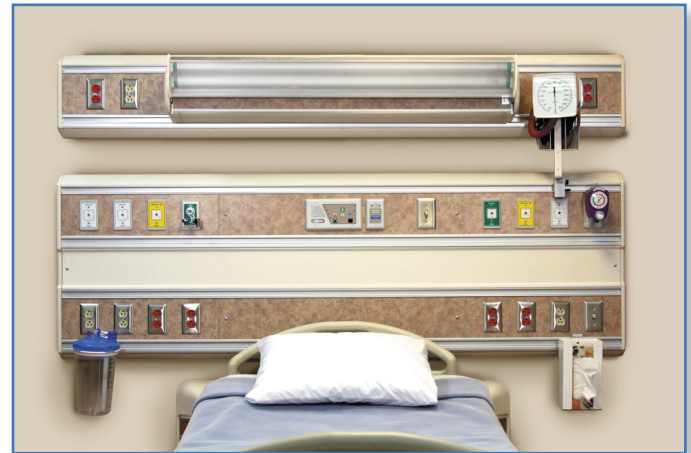
Figure 1. Majestic Series Double Tier Headwall System

The Amico Majestic Series Double Tier Headwall shall be manufactured by Amico Corporation, in accordance with job specific shop drawings and documents. The complete Headwall assembly shall be cULus listed. The following is a general specification, and components listed may not be present or required in final product.