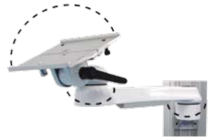
Fully adjustable tilt and pivot