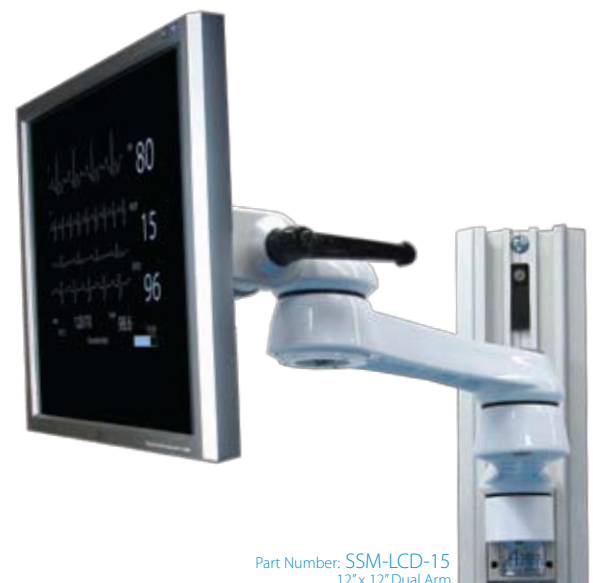
Part Number: SSM-LCD-15 12" x 12" Dual Arm