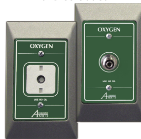
Amico Ohmeda Compatible or DISS Outlet