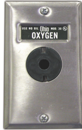
Diamond 1 Outlet