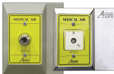
Amico DISS or Ohmeda Compatible Outlet