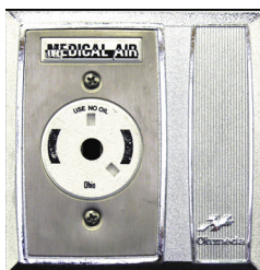
Daimond 3 Outlet