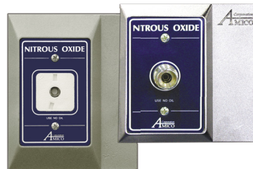
Amico Ohmeda Compatible or Diss Outlet