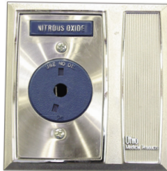
Daimond 2 Outlet